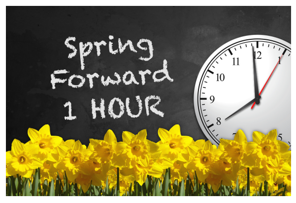
Remember the clocks go forward an hour tonight!