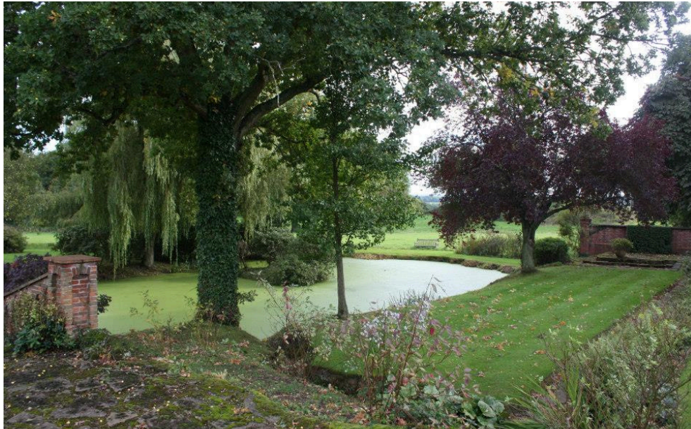
taken in the 'Paradise Garden' at Wychcroft.