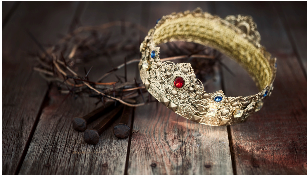
The Festival of Christ the King