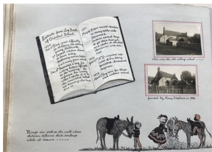
Extracts from WI History of Chipstead, held in Surrey Archives