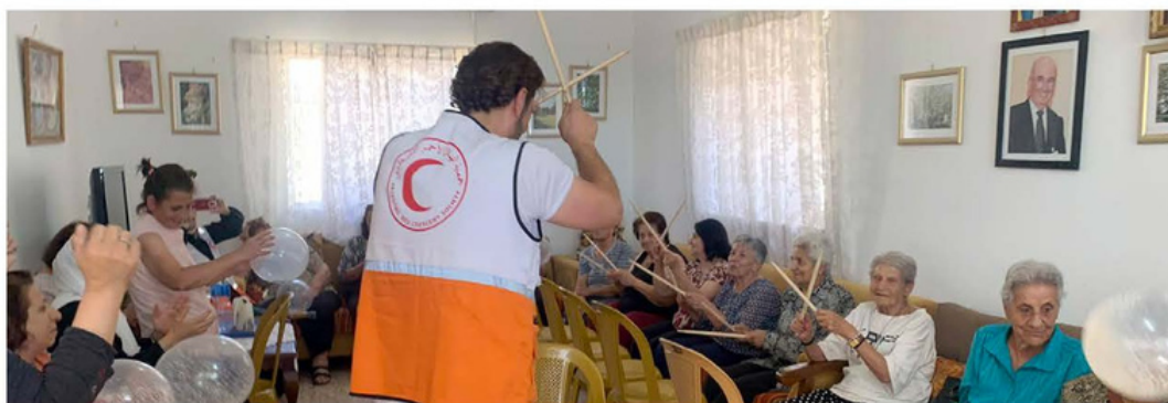
The women at Martha's House enjoying a fun activity involving balloons and sticks.

staff. When it began it relied upon the help of volunteers in order to achieve its vision of serving and helping women who found themselves in need. Several of those who started as volunteers of them are still part of our staff team now.